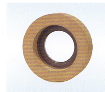
Z017 BK轮 BK wheel

BK Wheels for Straight Line Glass Edging Machine BD Wheels for Straight Line Glass Edging Machine BD Bottom Wheels for Straight Line Glass Edging Machine Stone Wheels for Straight Line Glass Edging Machine X3000 Wheels for Straight Line Glass Edging Machine