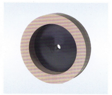
Z020 连底BD BD wheel with bottom