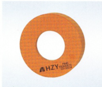
Z014 10S水松抛光轮 10S polish wheel

130×60×35(mm) 目数/MESH: 10S40, 10S60, 10S80