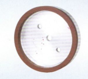
Z010 直边机树脂轮(B型) 颜色(红/绿)

规格/SIZE: 150×10×10(mm) 孔径/HOLE: 12mm, 22mm, 50mm 目数/MESH: 180#, 240#, 320#