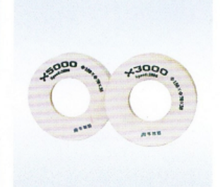
Z025 X3000 , X5000 X3000 , X5000 wheel