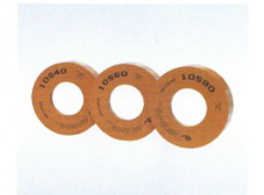
Z012 进口10S水松抛光轮 Import 10S polish wheel

规格/SIZE: 130×20×22(mm) 孔径/HOLE: 12mm 目数/MESH: 800#