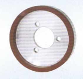
Z009 直边机树脂轮(B型) 颜色(红/绿)

Edging machine resin wheel (TypeB)Color (red/green)